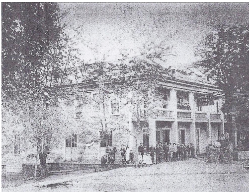
The Forest House in 1858

Two years later gold was discovered in the area in large quantities. That meant Forest Hill (original spelling) as